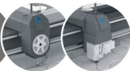
大象机头 (Mammut Head)